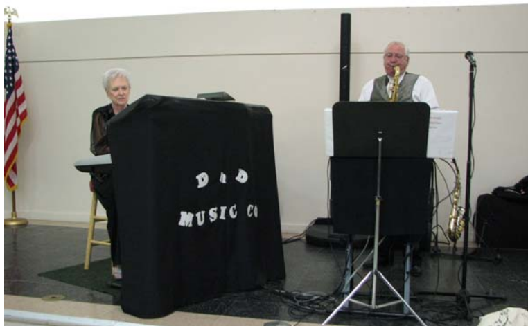
D & D Music Group at the January USA Dance Ocala Chapter

USA Dance Ocala. The best food at any dance! YUM!